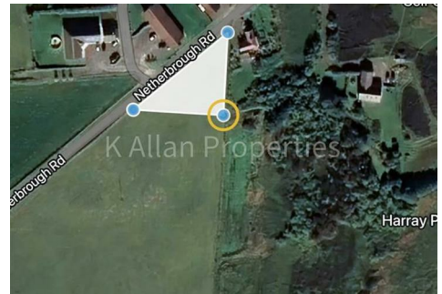
Land 2 land near Caperhouse, Netherbrough Road, Harray, Orkney, KW17 Offers In The Region Of £45,000

K Allan Properties are delighted to present this area of land to the market for sale which is positioned on the West Mainland of Orkney, in the Parish of Harray. Positioned beautifully in a meadow, overlooking countryside, and benefiting from panoramic rural views.