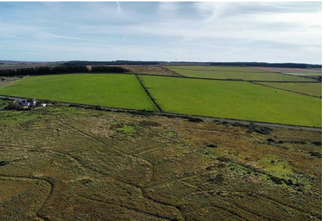
Plot by East Lodge, Upper Road, Mey, Caithness, KW14 8XH