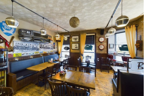
Busters Diner, 1 Mounthoolie Place, Kirkwall, KW15 1JZ